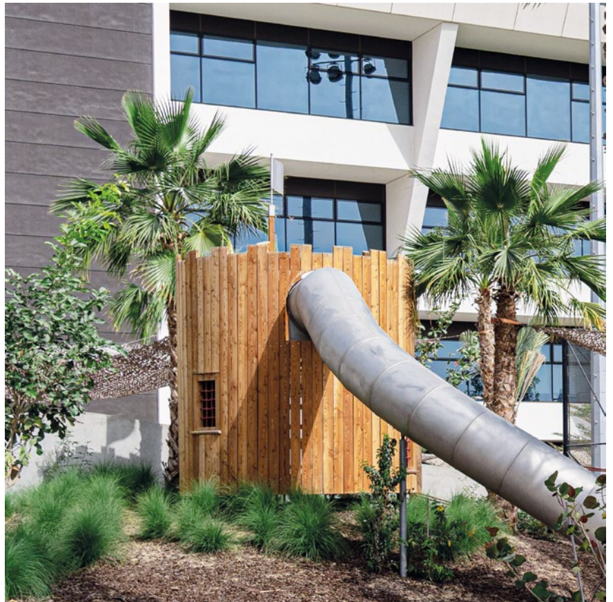
Special version with slide