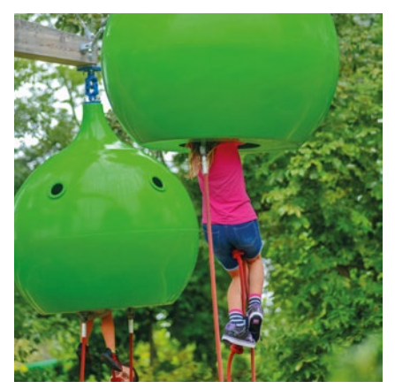
Standard colour of climbing ropes: rainbow