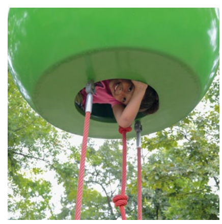
Standard colour climbing rope: rainbow