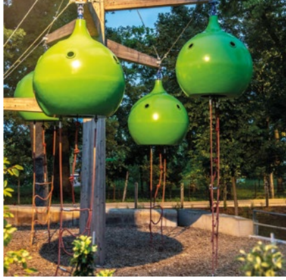
Standard colour of climbing ropes: rainbow