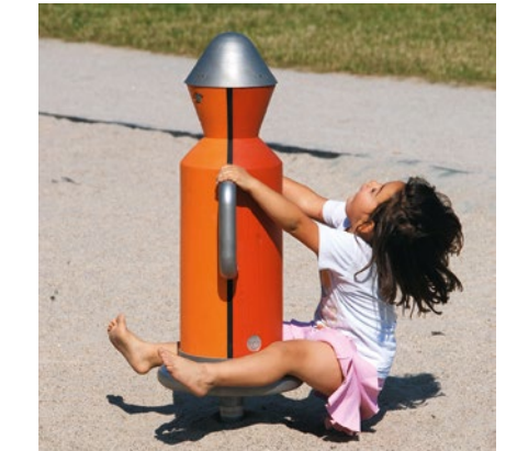
Order No. 6.28100 Whirligia with Arms, red / orange