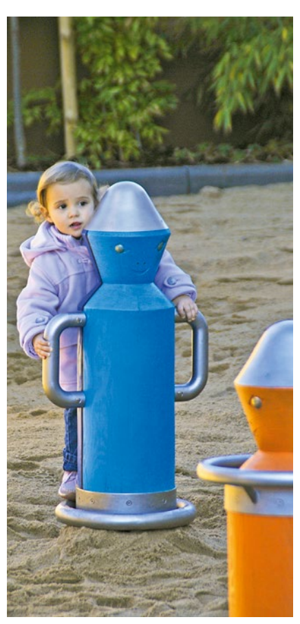
Order No. 6.28100 Whirligig with Arms, light blue / blue