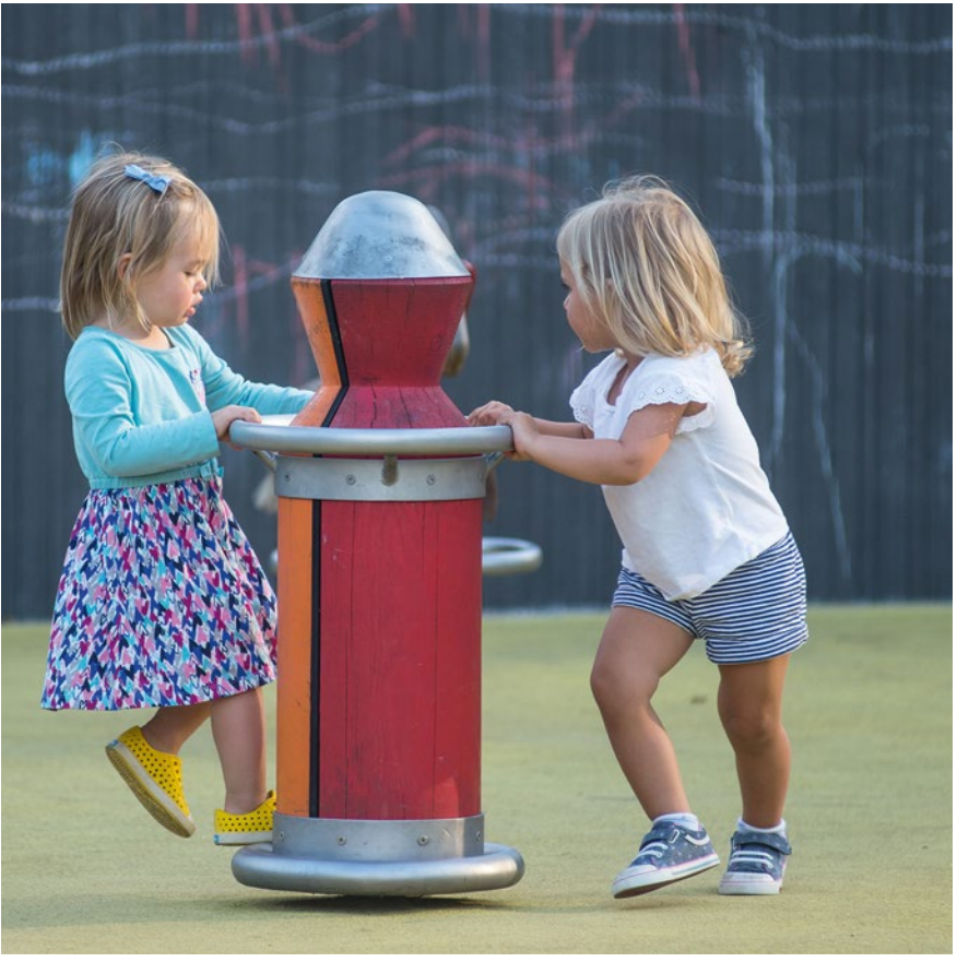
Order No. 6.28104 Whirligig with Collar, red / orange, Photo © Daniel Perales